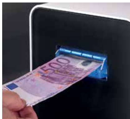
Accepts and verifies all banknotes, including € 500 note