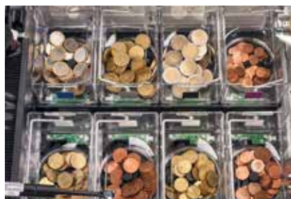
Each coin has its own hopper. Maximum reliability and speed