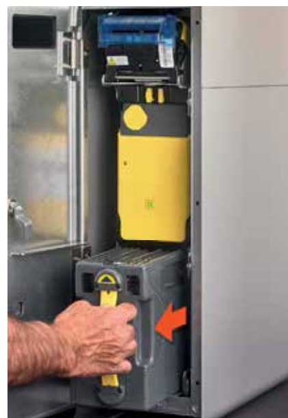
Collection of banknotes in a closed module. Nobody sees or touches the money