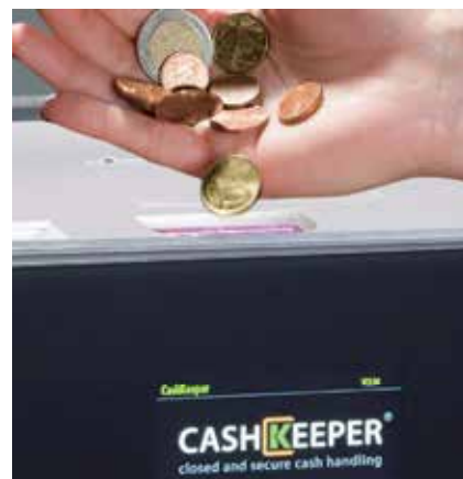
Accepts, validates and pays out all coins