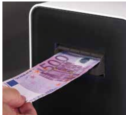
Accepts and verifies all bills, including €500