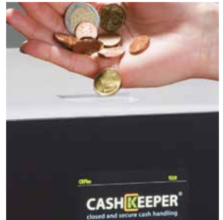
Accepts, approves, recycles and pays all coins