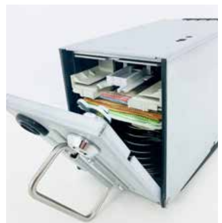
Closed cash drawer. No one sees or touches the money.

New generation bill approval system. Approval extended to the entire width of the bill. Current technologies only approve the central part of the bill.