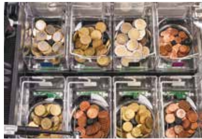
Each coin has its own hopper. Maximum reliability and speed