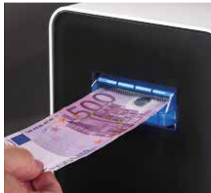
Accepts and verifies all banknotes, including € 500 note