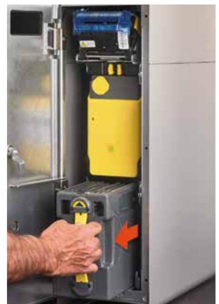
Collection of banknotes in a closed module. Nobody sees or touches the money